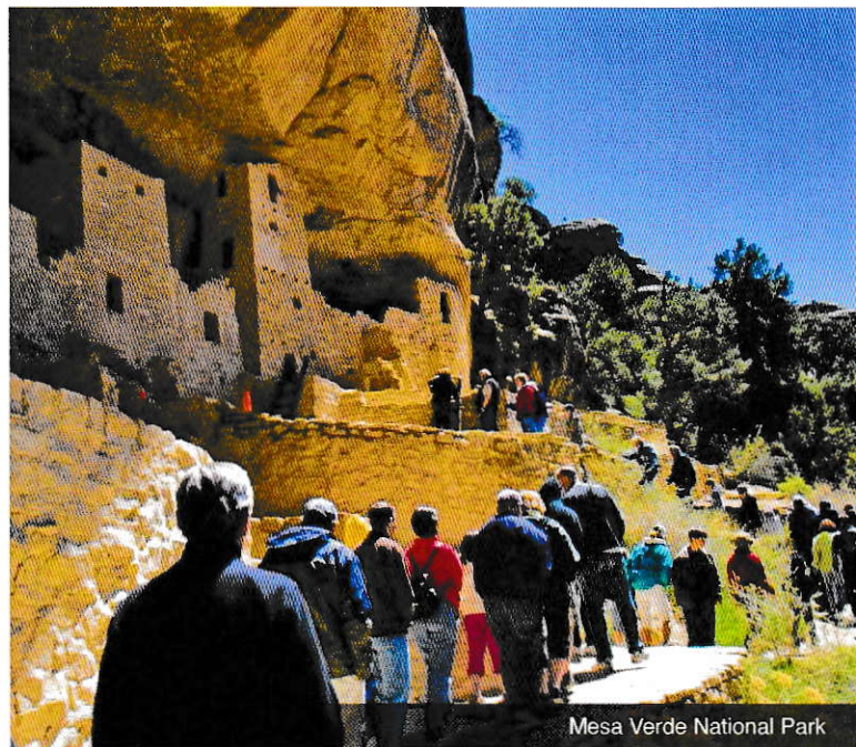
Mesa Verde National Park