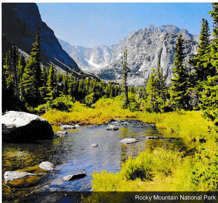
Rocky Mountain National Park