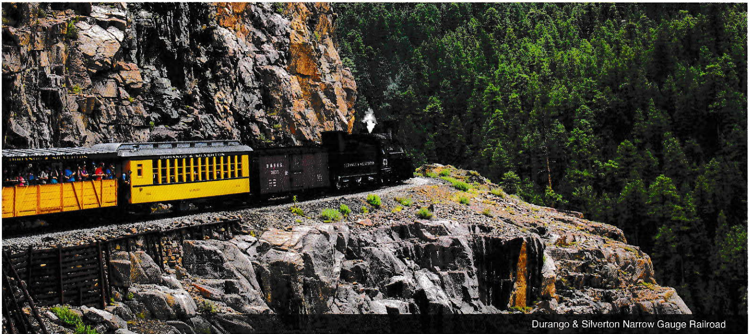
Durango & Silverton Narrow Gauge Railroad

DAY 6 Cumbres & Toltec Scenic Railroad: Your day begins as you board the motorcoach and ride to the Cumbres & Toltec Scenic Railroad, the original Rio Grande Line. This is America's most spectacular narrow gauge steam railroad. Explore 50 miles of wild and rugged territory between Chama, New Mexico and Antonito, Colorado, the highest point on the railroad. Meals: B, L